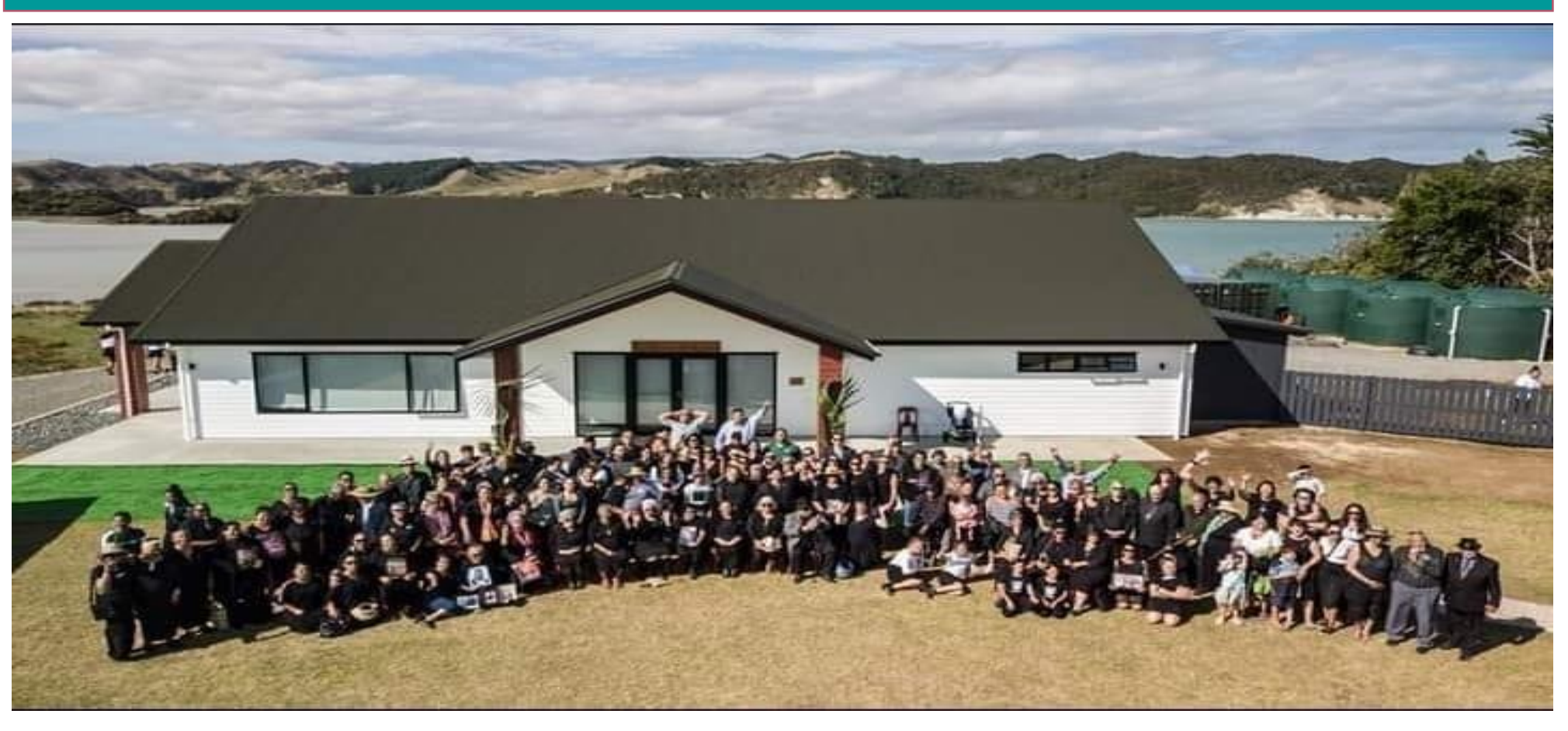
Photo: Waipapa Marae beneficiaries in front of Te Maru o Hikairo Poukai 2019

Building the capacity, capability and long term sustainability of our Marae for our beneficiaries