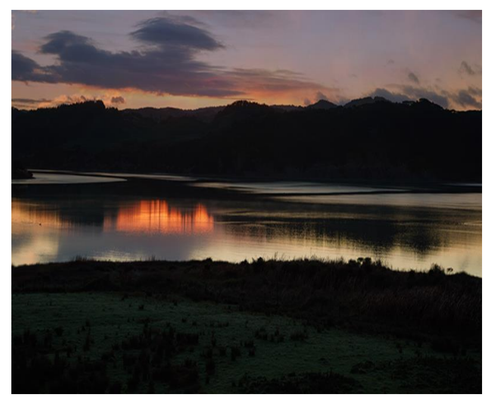
Photo: Looking out from the veranda at the back of Te Maru o Hikairo, to the northern end of the Kāwhia Harbour